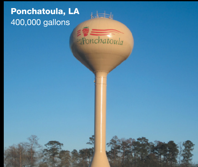
Ponchatoula, LA 400,000 gallons