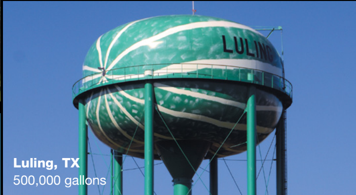
Luling, TX 500,000 gallons