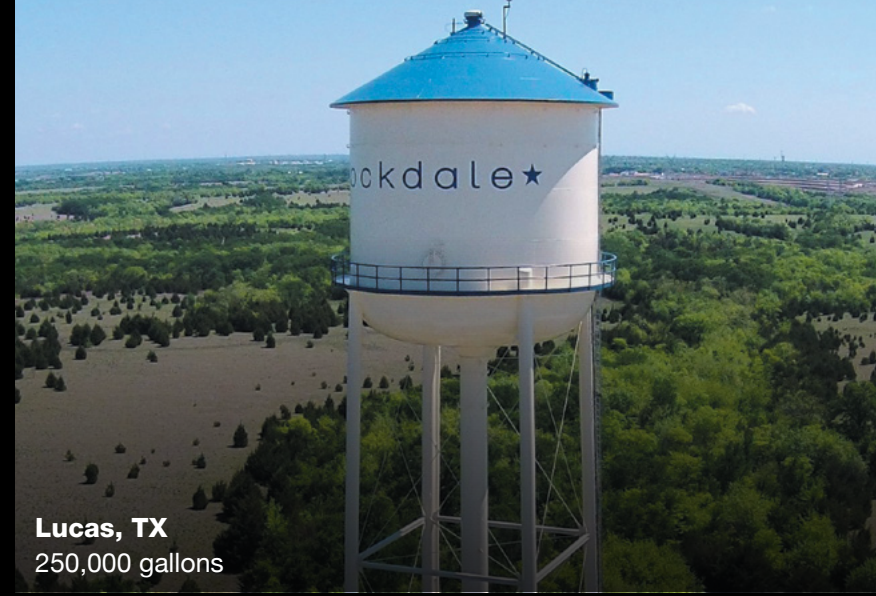
Lucas, TX 250,000 gallons