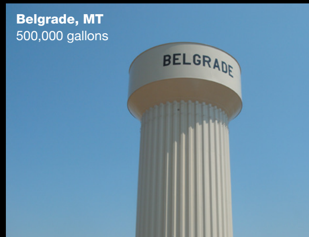
Belgrade, MT 500,000 gallons