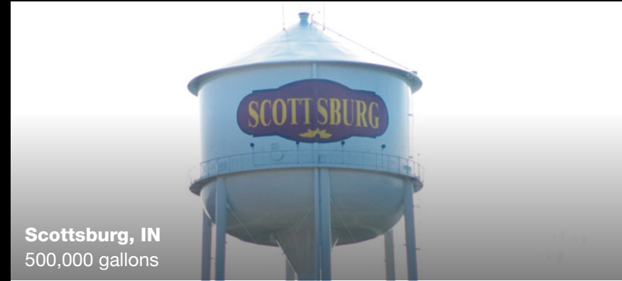
Scottsburg, IN 500,000 gallons