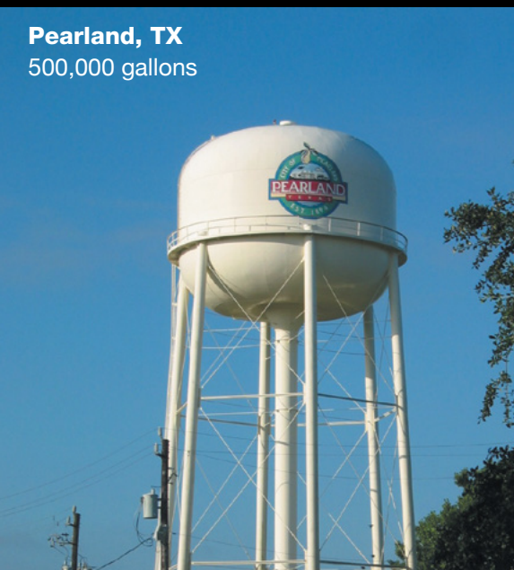
Pearland, TX 500,000 gallons