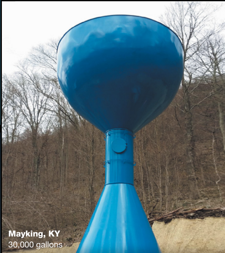
Mayking, KY 30,000 gallons