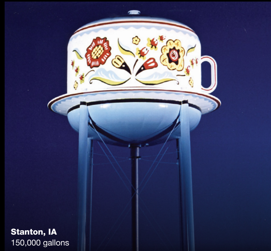
Stanton, IA 150,000 gallons